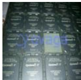
5CGXFC5C6F23C7N Altera Corporation (Intel) FBGA-484