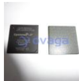
5CEFA2F23I7N Altera Corporation (Intel) FBGA-484