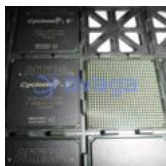
5CEFA9F27I7N Altera Corporation (Intel) FBGA-672