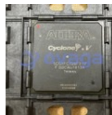
5CGXFC7D6F31I7 Altera Corporation (Intel) FBGA-896