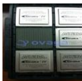
EP4SGX230FF35C3N Altera Corporation (Intel) FBGA-1152