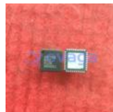
ADV7393BCPZ Analog Devices, Inc LFCSP-VQ-40