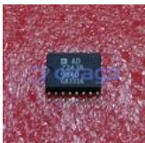
AD724JR Analog Devices, Inc SOIC-16