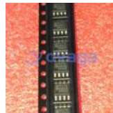
AD8170AR Analog Devices, Inc SOP8