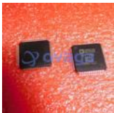
ADV7181CBSTZ Analog Devices, Inc LQFP-64