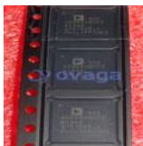
AD9680BCPZ-500 Analog Devices, Inc LFCSP-64