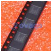
ADAS3022BCPZ Analog Devices, Inc LFCSP-40