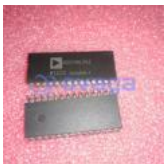
AD574AJNZ Analog Devices, Inc PDIP-28