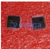
AD7938BSUZ Analog Devices, Inc TQFP-32