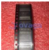
AD7401YRWZ Analog Devices, Inc SOIC-16