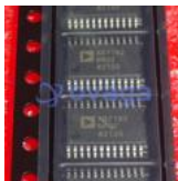
AD7192BRUZ-REEL Analog Devices, Inc TSSOP-24