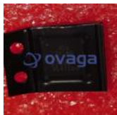
ADV7391WBCPZ Analog Devices, Inc LFSCP-3