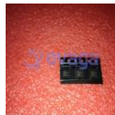
ADV7390BCPZ Analog Devices, Inc QFN32