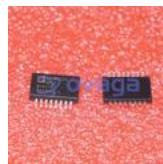
ADUM4160BRIZ Analog Devices, Inc SOIC-16