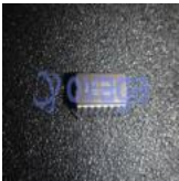
HI1-5042-2 Renesas Technology Corp CDIP-16