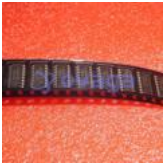
HIN202EIBNZ Renesas Technology Corp SOIC-16