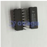
HI1-5051-2 Renesas Technology Corp CDIP-16