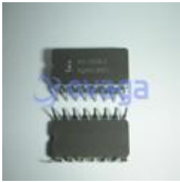
HI1-0508-2 Renesas Technology Corp CDIP-16