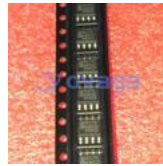
AD8170AR Analog Devices, Inc SOP8