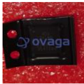
ADV7391WBCPZ Analog Devices, Inc LFSCP-3