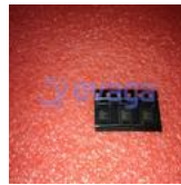
ADV7390BCPZ Analog Devices, Inc QFN32