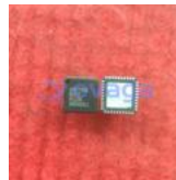
ADV7393BCPZ Analog Devices, Inc LFCSP-VQ-40