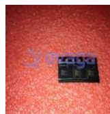
ADV7390BCPZ Analog Devices, Inc QFN32