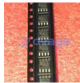
AD8170AR Analog Devices, Inc SOP8