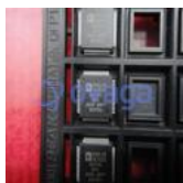
ADV7341BSTZ Analog Devices, Inc LQFP-64