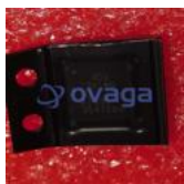
ADV7391WBCPZ Analog Devices, Inc LFSCP-3